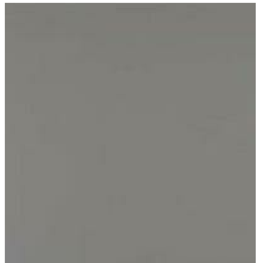
GLAZING - PURE GREY

ESa Earl Swenson Associates, Inc. James Todd Robinson, Architect 1033 Demonbreun Street Suite 800 Nashville, Tennessee 37203 615-329-9445 Firm License Number AAC001464 This drawing and the design shown is the property of the architect. The reproduction, copying or use of this drawing without their written consent is prohibited and any infringement will be subject to legal action. © Earl Swenson Associates, Inc. 2020