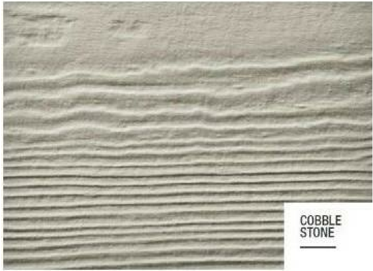
SHIPLAP - JAMESHARDIE COBBLE STONE