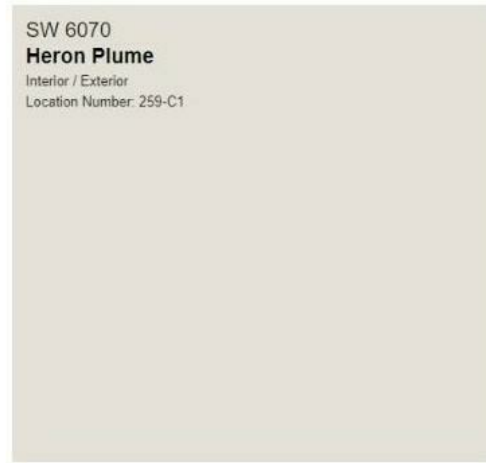
LIGHT EIFS - SW HERON PLUME