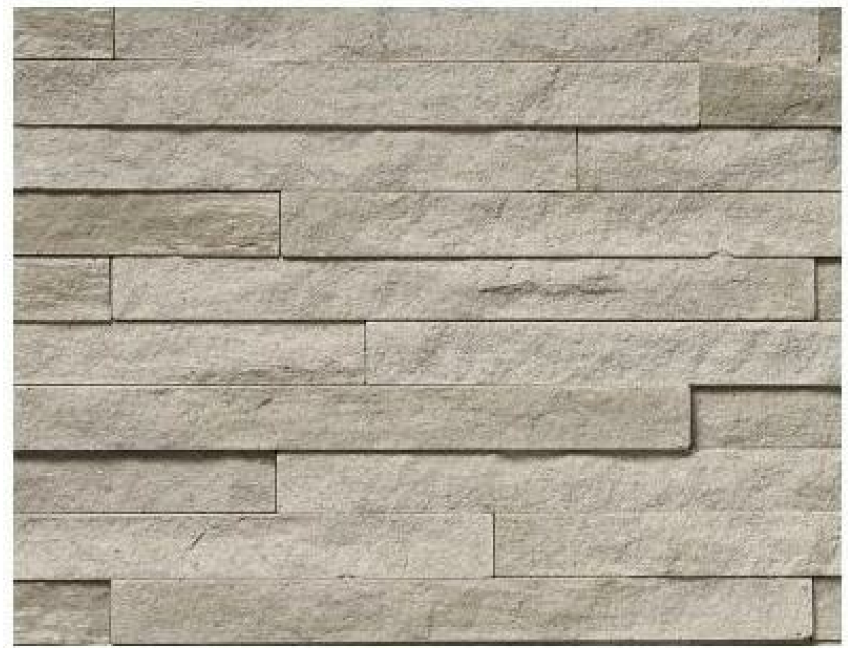
STONE - ARRISCRAFT VILLE-MARIE