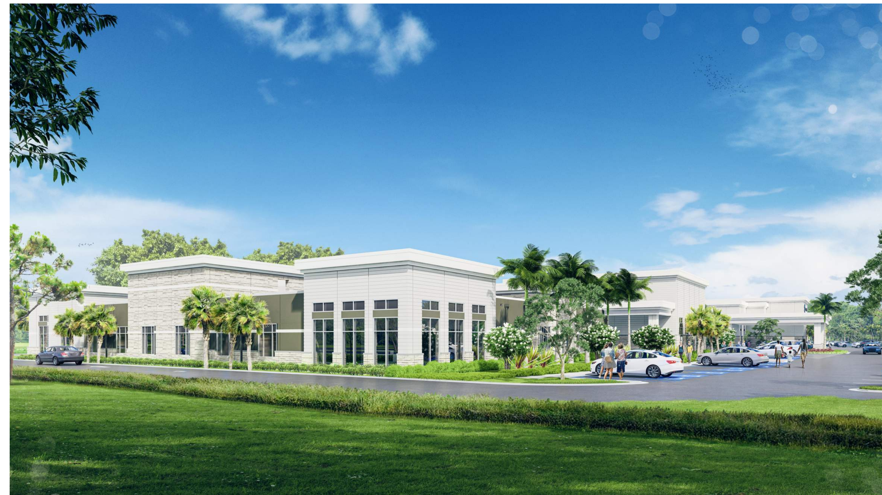
PHASE 1 & 2 - VIEW FROM THE NORTHEAST