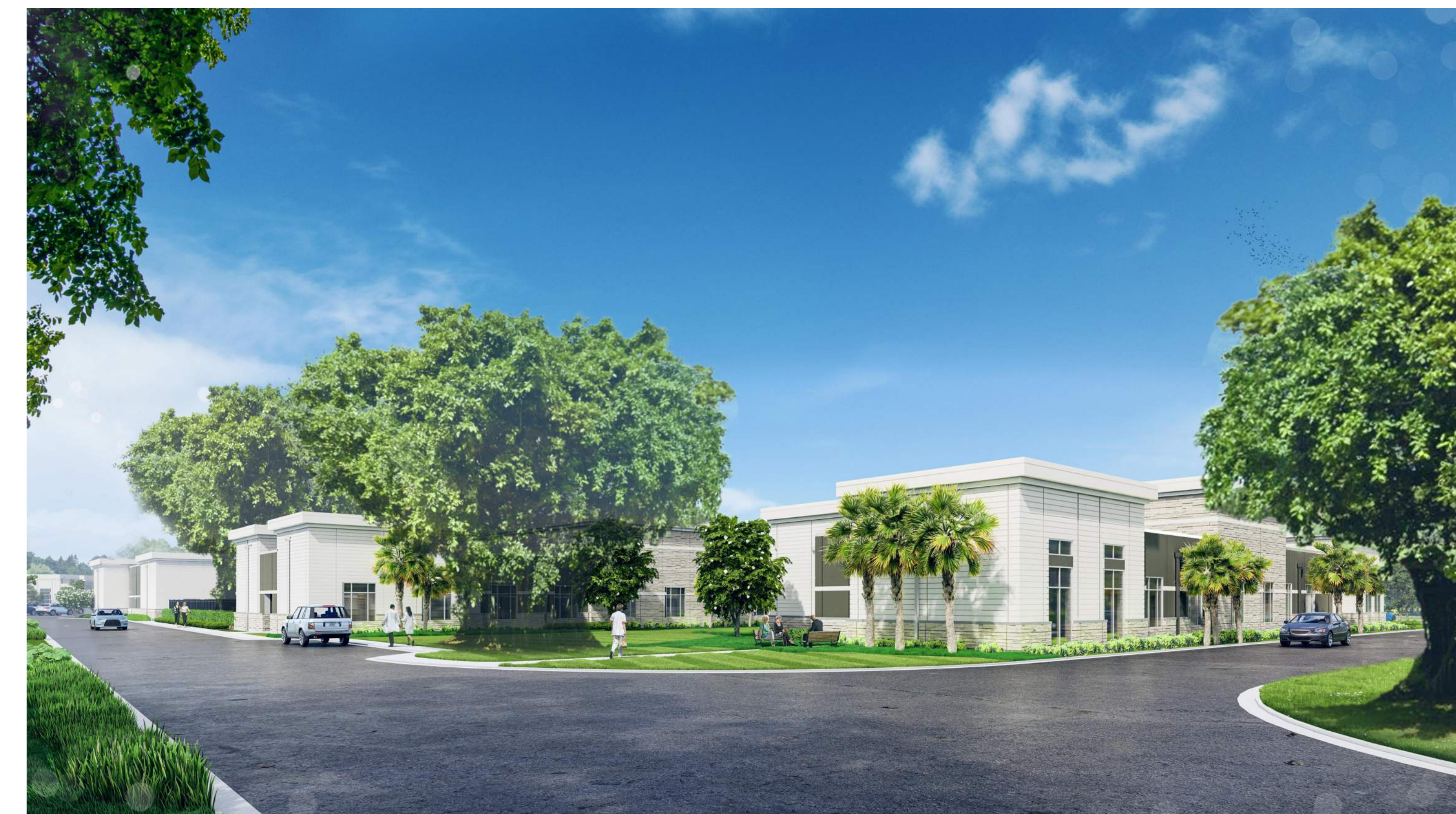
PHASE 1 & 2 - VIEW FROM THE SOUTHEAST