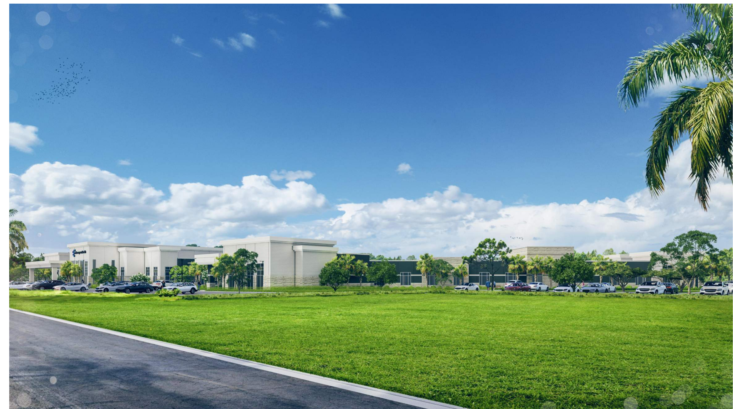
PHASE 1 & 2 - VIEW FROM THE NORTHWEST