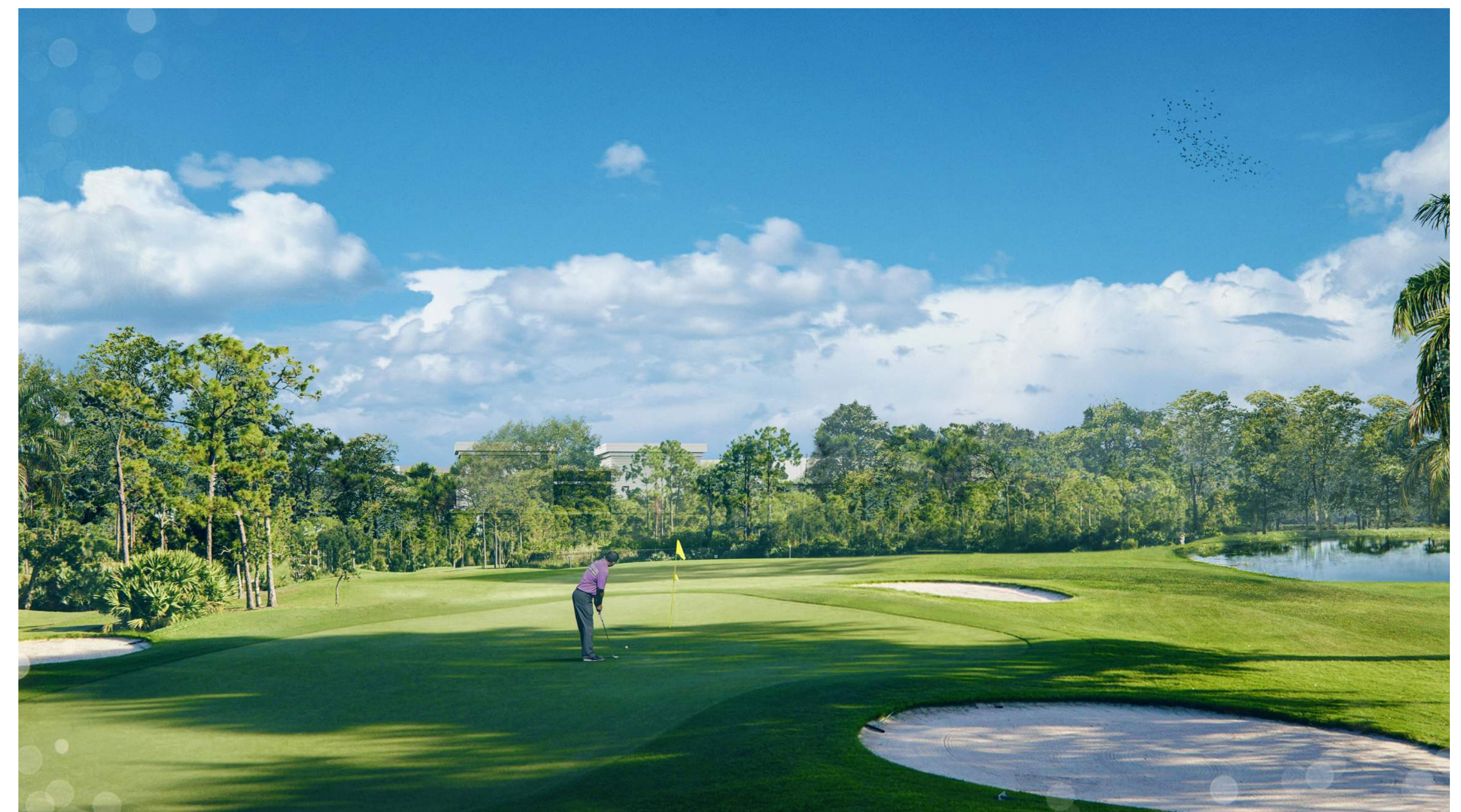
PHASE 1 & 2 - VIEW FROM THE SOUTHWEST