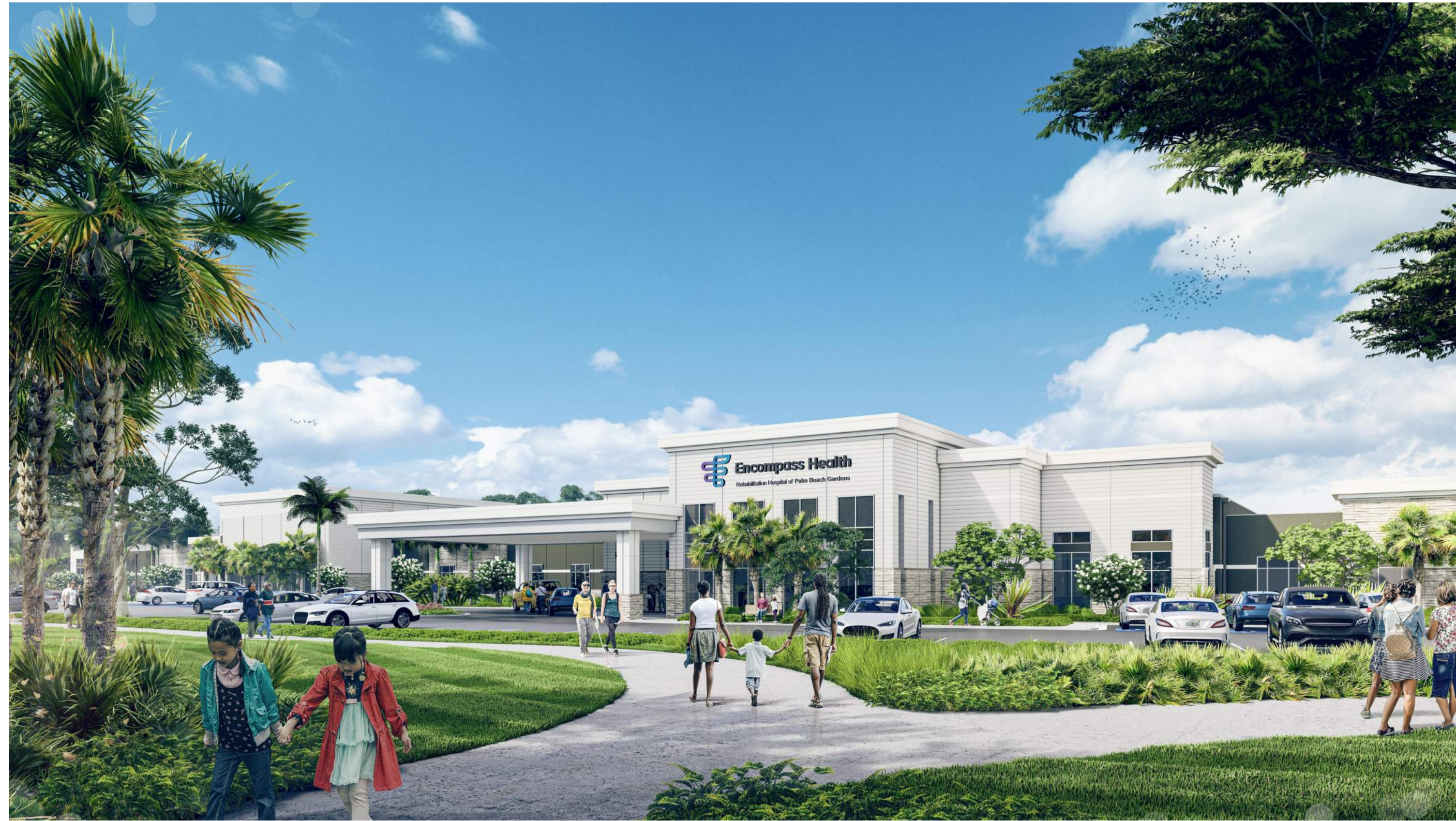
PHASE 1 & 2 - VIEW OF THE MAIN ENTRANCE FROM THE NORTH

2/16/2023 5:58:36 PM BIM 360://2023000 - Encompass Rehabilitation Hospital Palm Beach Gardens/2023000 - Encompass Palm Beach Gardens.rvt