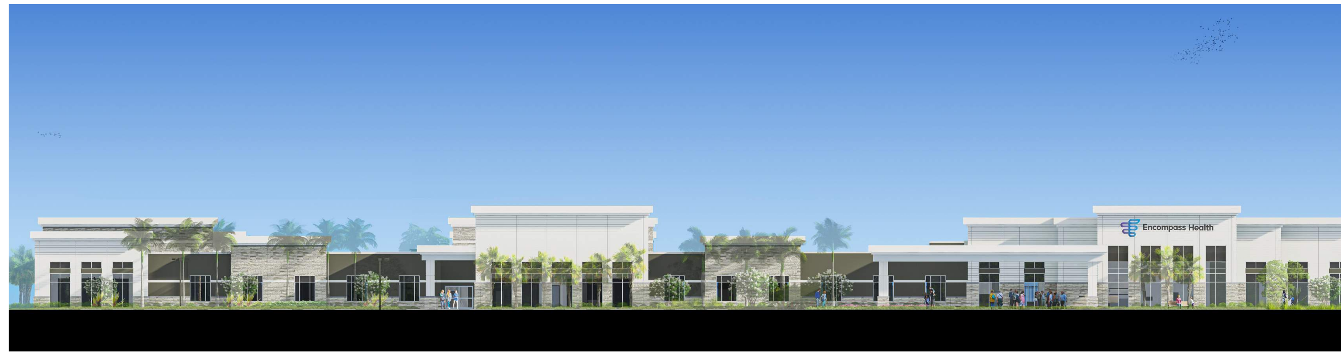
NORTH ELEVATION PHASE 1

2/16/2023 5:58:37 PM Bill 3061/20/2020 - Encompass Rehabilitation Hospital Palm Beach Gardens 2012000 - Encompass Palm Beach Gardens, FL