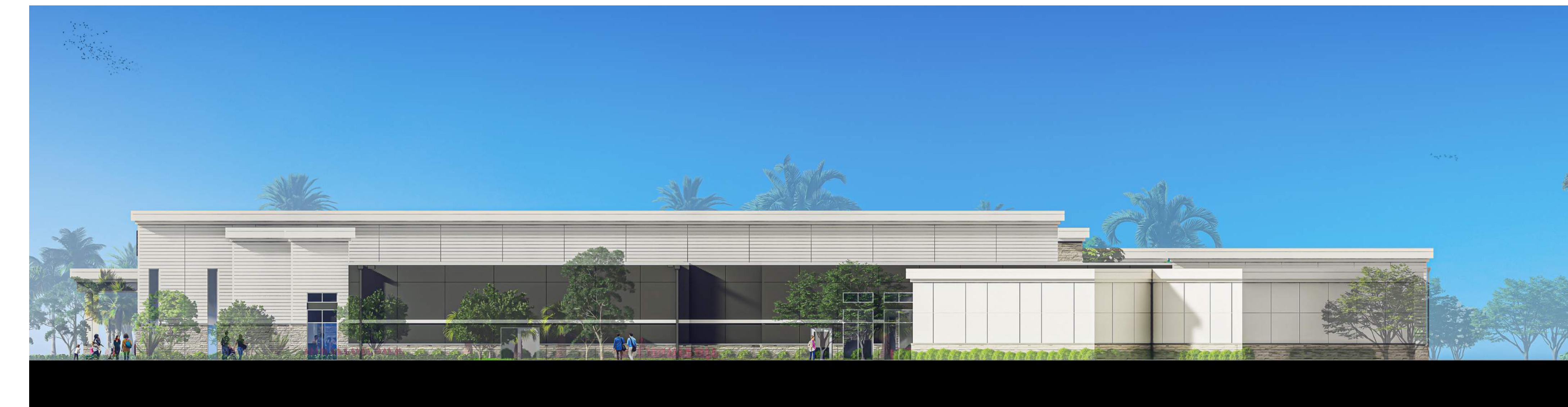
WEST ELEVATION PHASE 1