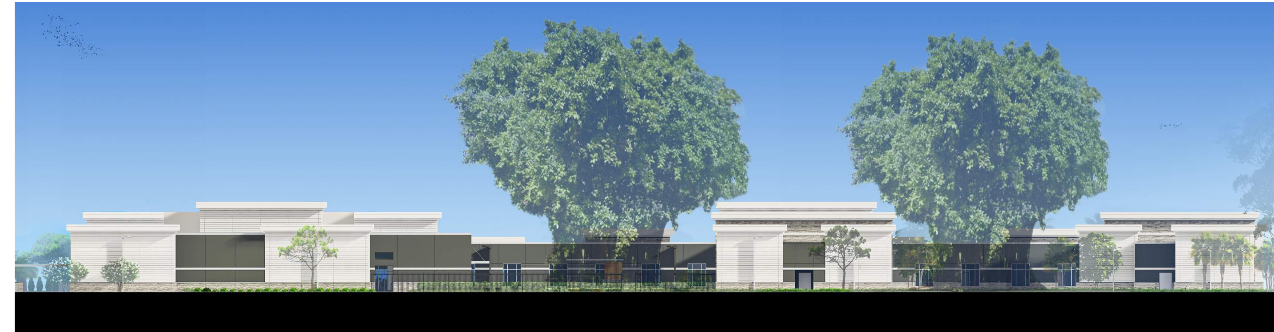
SOUTH ELEVATION PHASE 1